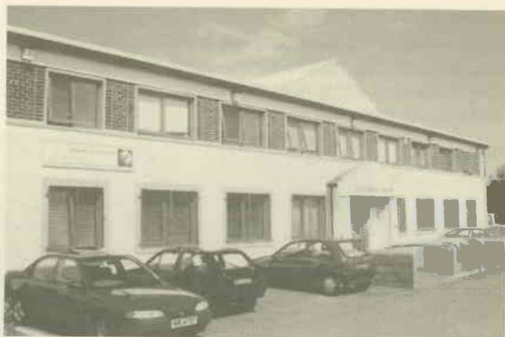
Above: Enterprise House, WIN Business Park

The Co-operative now provides workspace in Newry and Warrenpoint for some 70 individual businesses which together employ nearly 250 people.