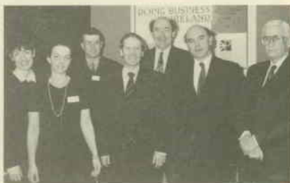
Above: "Doing Business in Ireland" - A major trading event attracting companies from all over Ireland. (Newry, March 1997)