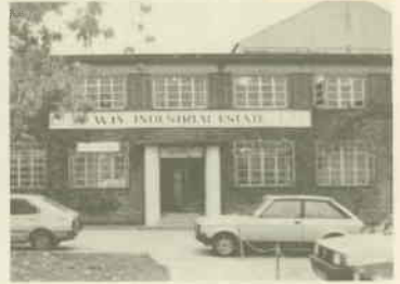
Right: The old WIN site