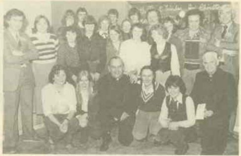
Right: Cardinal O'Faich pictured at the opening of Mournecraft in Crossmaglen