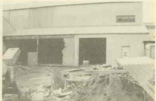
Right: Further Expansion at WIN